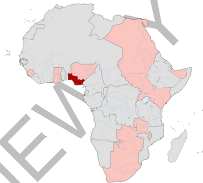
A map of Africa with Ghana highlighted.

Most of the cocoa beans grown in Ghana are sent to the United Kingdom and other countries in Europe where they are made into chocolate. The price farmers receive for their cocoa beans is often very low and few of them can afford to buy chocolate.